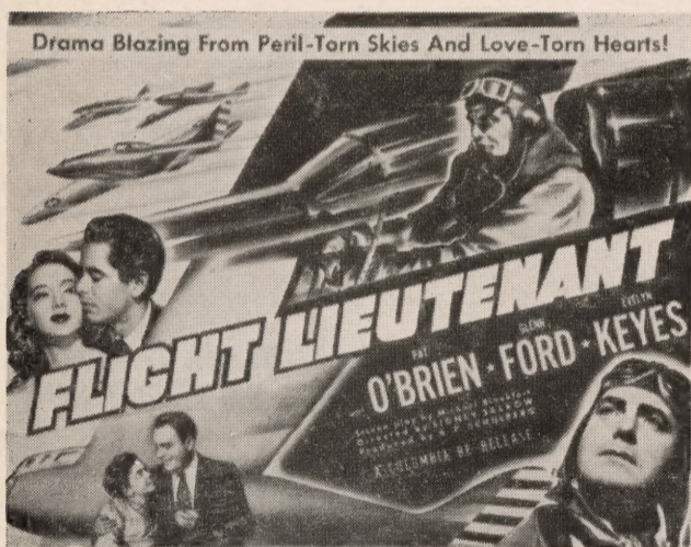
22 x 28